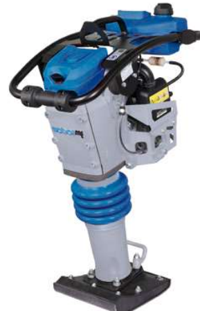
SRV 660 Hd